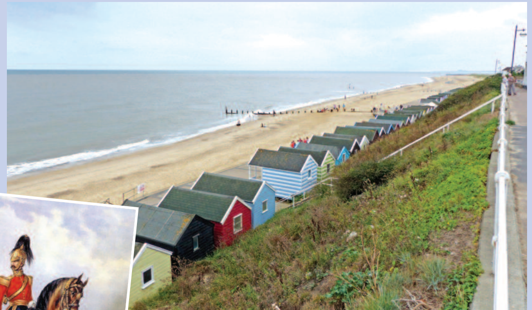
Above: During the eighteenth century pitched battles were fought at Southwold between smugglers and Revenue Men.