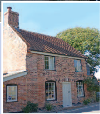
The Old Customs House is a reminder of Orford's smuggling era.