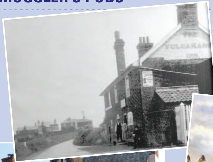
The Vulcan Arms, Sizewell as the smugglers would have known it.